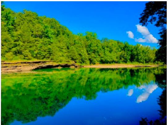
The Wild and Scenic Mulberry River @ Redding Campground

Streams are also found on the ground surface in caves and underneath and inside glaciers (large bodies of ice that formed on land by the compaction and recrystallization of snow and that survive year to year). Rivers, creeks, brooks, and runs are all streams. Most sources define a river simply as a large stream; creeks, brooks, and runs are simply small streams.